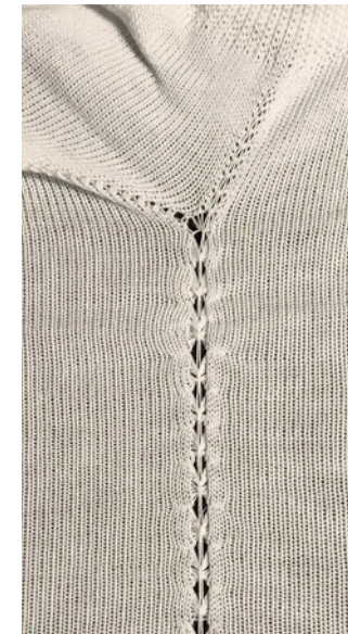
Tuck stitches caused by a bent needle latch