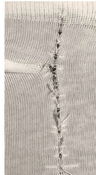
Knitting error caused by a broken needle

The following images show different knitting errors: