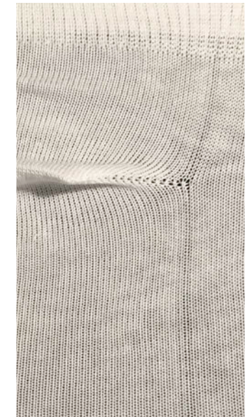
Needle lines caused by a stiff latch

dur™ needles can help to reduce different kinds of knitting faults.